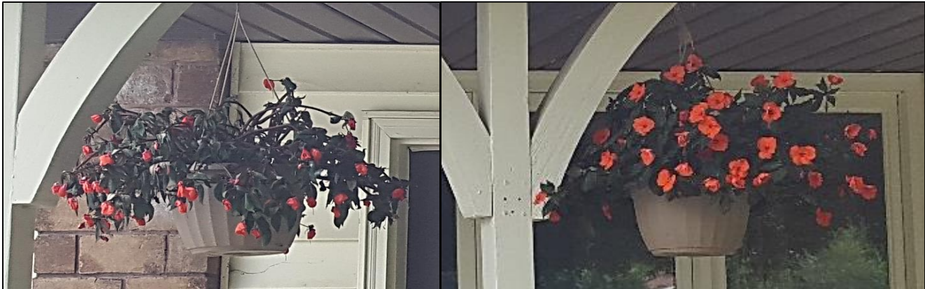
Without Moisture Manager™

Never before has the awareness of water conservation and its critical role in our lives been so apparent. To help us all rise to this challenge, we will begin offering a proprietary blend of soil moisture technology designed to reduce overall watering while eliminating or minimizing plant wilt cycles and drought stress.